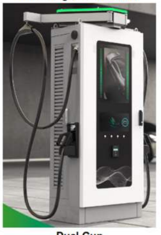
Dual Gun 120 kW / 160kW / 180kW