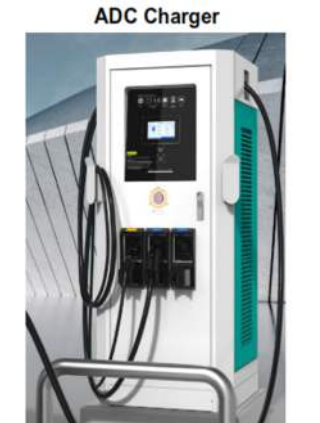
DC (Dual Gun): 60 kW - 200 kW AC (3rd Gun): 22 kW / 43 kW