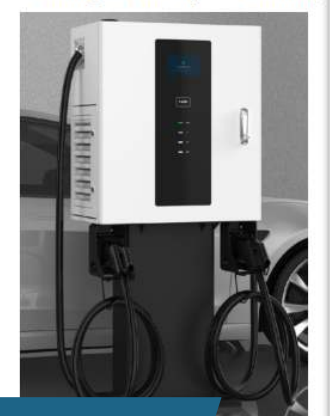
Dual Gun 40kW